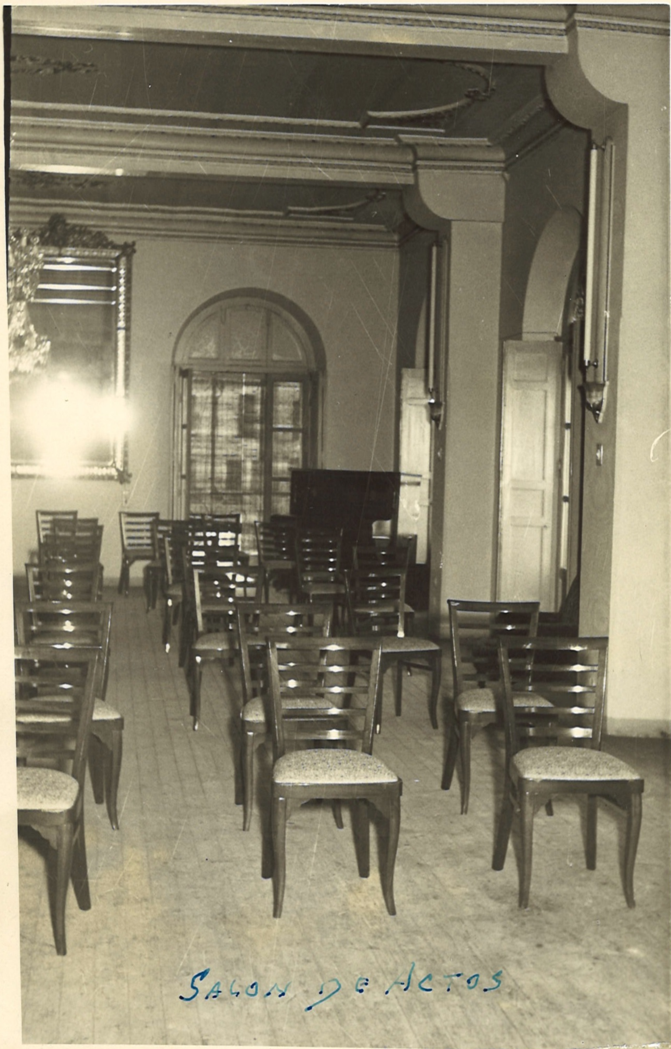
SALON DE ACTOS